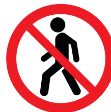
No pedestrians crossing